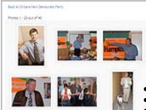
NDP supporters and organizers are posting their photos to Facebook.