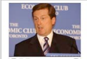
Conservative Leader John Tory has a video blog on his website.